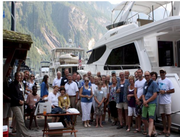
(right) Lots of cruisers attending our July BBQ